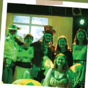
Halloween Party Disney Soc