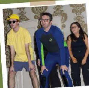
Maynooth's Best Dance Crew