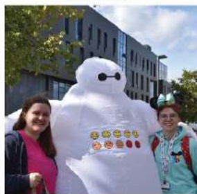
Meet & Greet Disney Soc