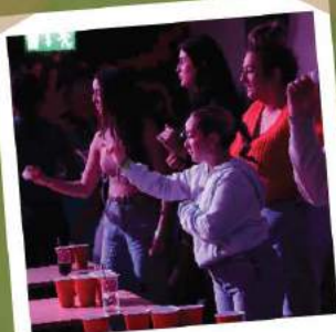
Water Pong MUCK X Surf X Snow