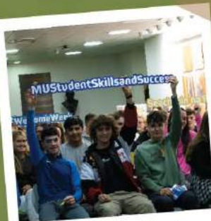
Welcome Week 2022