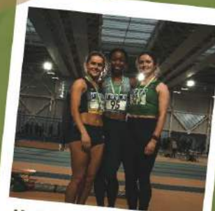
Uni Inter-varisities Athletics Club