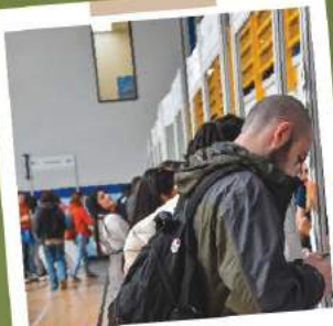
Fairs Day 2022