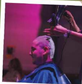
Shave or Dye Cancer Soc