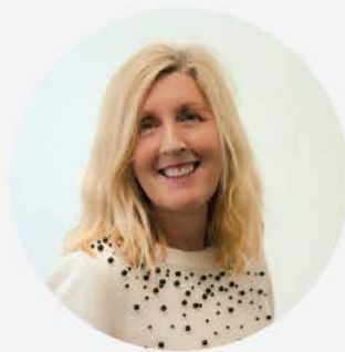
MARY MAC COURT

The committee comprises of 6 students rep from each category, MU Sports Officer, MSU VP for Student Life, and an MU Clubs & Socs Co-Ordinator. The categories for each student representative fall under Field, Development, Court, Martial Arts, Individual, and Outdoor, Adventure & Water.