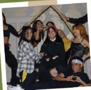
Maynooth's Best Dance Crew