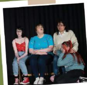
Debs Festival Drama Soc