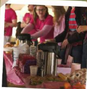
Turn Maynooth Pink Cancer Soc